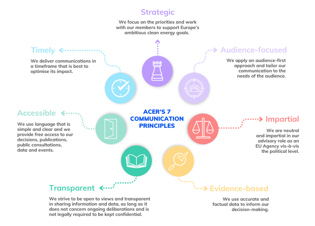
Figure 1: ACER's seven communication principles

Our shared commitment to these communication principles (shown in Figure 1) allows us to work together to achieve our communication goals.